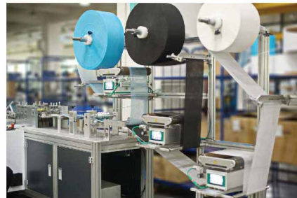
automatic optical correction feeding device